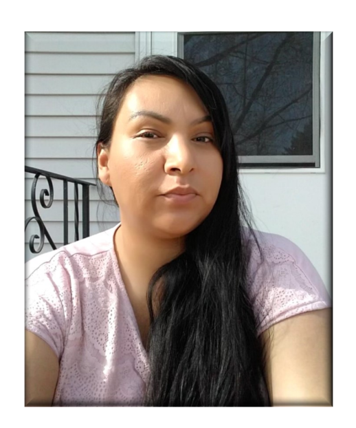
In Celebration of the Life of